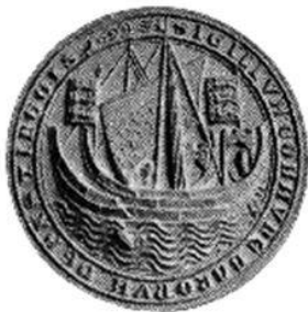
Seal of the barons of Hastings

During his rule the abbey was visited by king John on a few occasions – his visits to Battle are noted to be 6th April 1206, 25th and 26th April 1213 and 13th June 1213. In 1206 he appears to have been on a general progress from London to Dorset, by way of the north and south coasts of Kent and the coasts of Sussex and Hampshire. Before Battle he had been at Romney in Kent, and was moving on to Malling near Lewes. He gave a fine cassock at the time of this visit