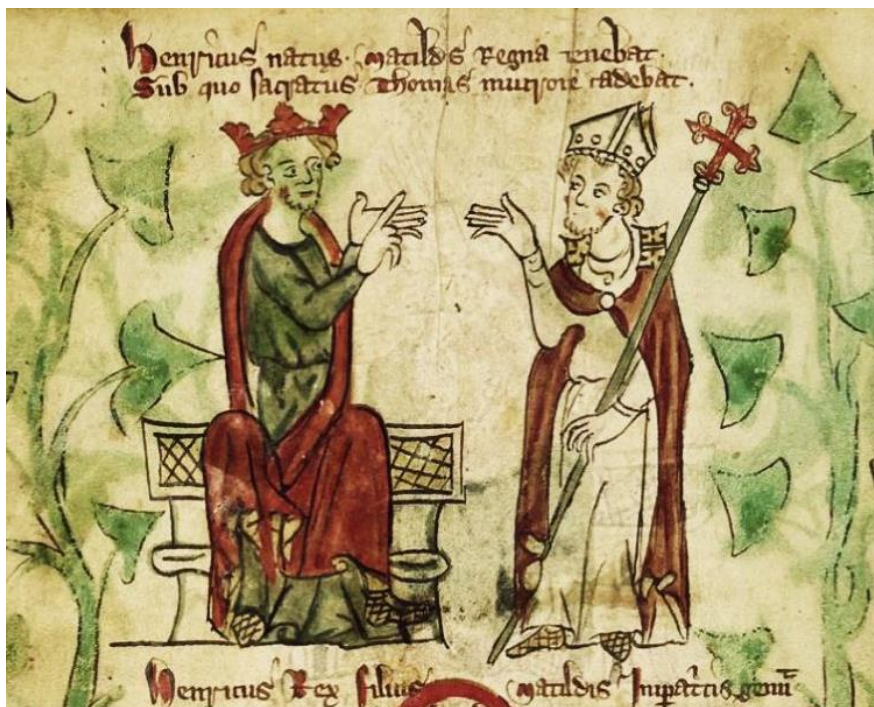
Miniature of Henry II enthroned, arguing with Thomas Becket.

The case which was heard on 23 May 1157 is transcribed in detail in Latin, with English notes over no less than 20 pages in 'The Rise and Progress of the English Commonwealth: Anglo-Saxon Period. Containing the Anglo-Saxon Policy, and the Institutions Arising Out of Laws and Usages which Prevailed Before the Conquest, Volume 2 by Sir Francis Palgrave (1832) pp xliv-lxiv . The details of the case are also given (from the perspective of Battle abbey of course) at considerable length in the 'Chronicle of Battle Abbey'. The preludes from 1148 are also described by Palgrave between pp xxviii and xliii.