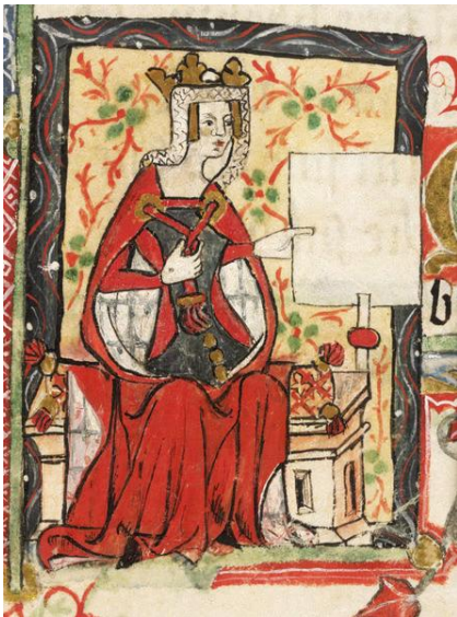
Portrait of Empress Matilda , from "History of England" by St. Albans monks (15th century); Cotton Nero D. VII, f.7, British Library

Pevensey castle was involved in the conflict between Matilda and Stephen, with its owners often switching sides. In 1147 Gilbert de Aquila (or de l'Aigle), whose father had been a supporter of Robert Curthose, rebelled against King Stephen. Stephen besieged and starved the occupants to take the castle, and then gave it and its property to Eustace, his eldest son. Following this Eustace made various grants of Pevensey's fiefs, chapelry and fishing rights to Richard de Luci (see below), to the see of Chichester and to Lewes Priory. The details of events during the Anarchy are complex, but no other noted events took place in eastern Sussex.