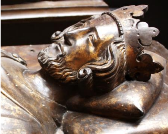
Effigy of King Henry III in Westminster Abbey by Valerie McGlinchey [CC BY-SA 2.0 ( http://creativecommons.org/licenses/by-sa/2.0 )], via Wikimedia Commons