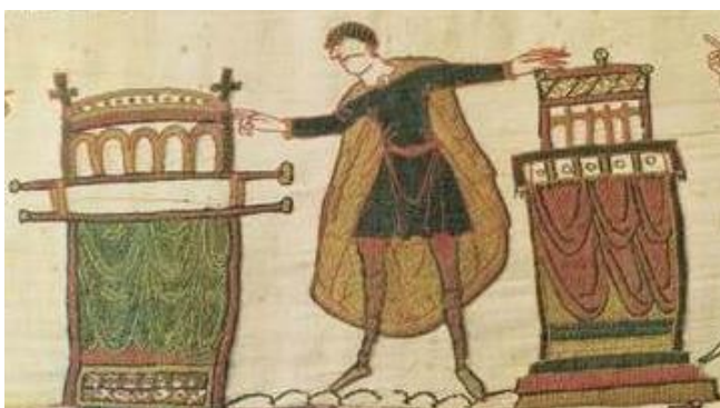
Harold swearing on portable shrines (feretories). Extract from the Bayeux Tapestry

After his father's death and at his coronation in 1087 Rufus had given Battle abbey, it is believed at William I's command, for his soul, a number of items. These included his father's royal cloak trimmed with gold and jewels, 300 gold and silver amulets (small objects to ward off evil, harm, or illness or to bring good fortune), and a feretory (a portable shrine, see illustration).