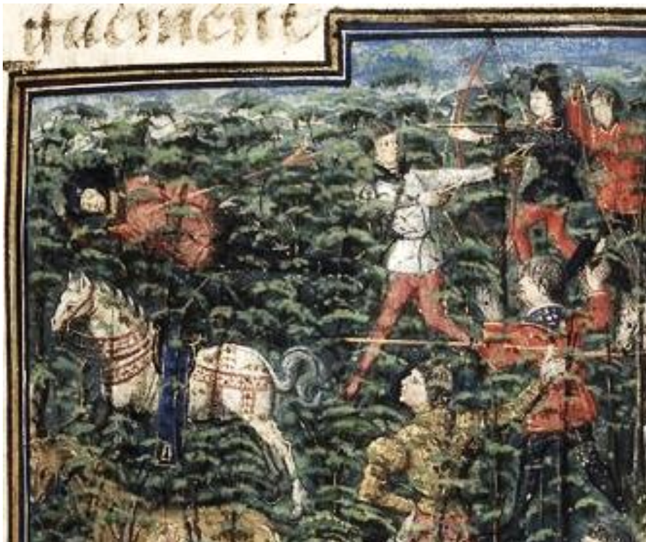
Extract from a miniature of the death of William Rufus, in the 'Grande Chronique de Normandie' British Library: Yates Thompson 33 f. 186