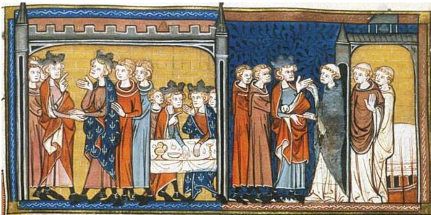
Miniature of Henry III visiting Louis IX, and Henry III at St Denis.

As his father had done with the 1215 Magna Carta Henry obtained a papal bull in 1261, proclaiming the reforms unconstitutional. Henry began to reassert his authority and by late 1261 the majority of reformers had acquiesced. Chief reformer, the Earl of Leicester, Simon de Montfort, Henry's brother-in-law, and married to Henry III's sister Eleanor, the youngest daughter of King John, returned to his native France.