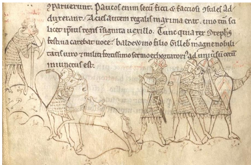
Marginal drawing of the Battle of Lincoln, in Henry of Huntingdon's Historia Anglorum. Captions identify the man to the left as Baldwin FitzGilbert and the central crowned figure as King Stephen; the king is directing Baldwin to address the army on his behalf.

Stephen wanted his son Eustace to inherit his throne. He tried to convince the church to agree to crown Eustace to reinforce this claim, but Pope Eugene III refused. Meanwhile in Anjou Mathilda's second husband, the count of Anjou died in 1151 and their son Henry became the new leader of Anjou. In 1152 Henry married Eleanor of Aquitaine, who had divorced the French king, and so between them they then held the vast territories of Anjou, Poitou and Aquitaine.