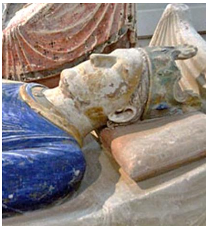
Tomb effigy of King Henry II at Fontevrault abbey