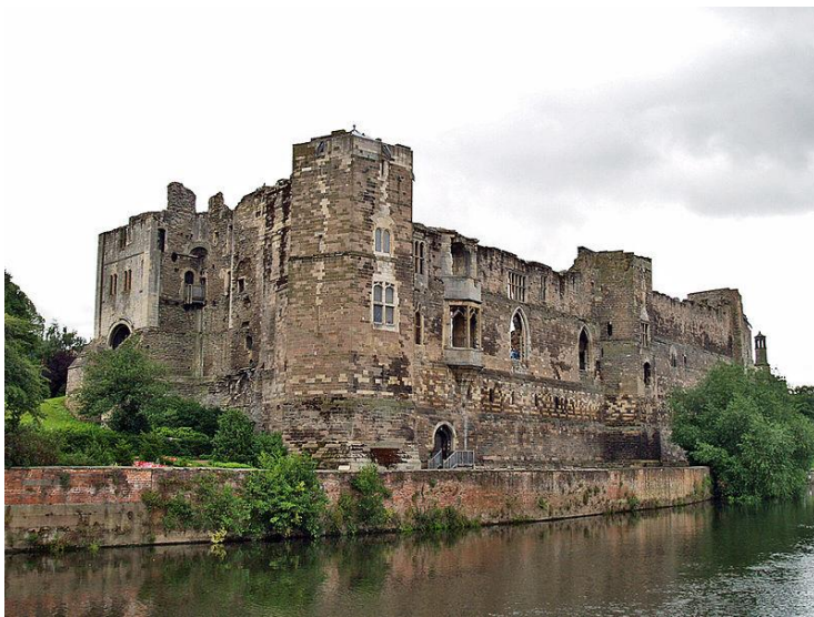
Newark castle, where King John died

This was at the cost of the abbey gradually losing its rights to administer justice within its leuga, but armed with royal charters, it was able to elect its own abbot, recover and retain its lands coveted by greedy neighbours, and in fact expand its estates, and to keep its profits between losing one abbot and appointing the next.