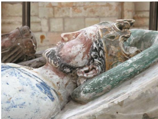
Richard I's tomb effigy at Fontevrault abbey

He never visited Battle. But nevertheless he did find time to confirm Battle abbey's charter, but not the sole right of the abbot to dispense justice within the leuga, which now increasingly fell into the remit of the realm's itinerant justices.